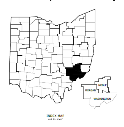
Exhibit 1: Project location map